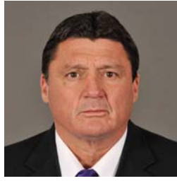
Ed Orgeron Head Coach