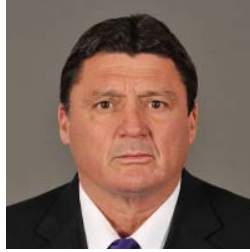
Ed Orgeron Head Coach