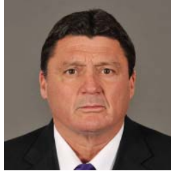
Ed Orgeron Head Coach