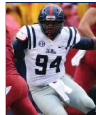
◀ WHITE TOP/ NAVY TRIM/ GRAY PANTS