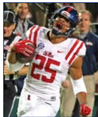
◀ WHITE TOP/ RED TRIM/ WHITE PANTS