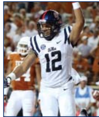
◀ WHITE TOP/ NAVY TRIM/ WHITE PANTS