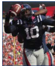
◀ NAVY TOP/ GRAY PANTS