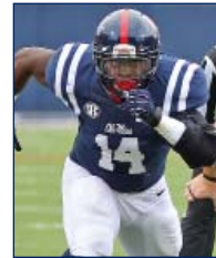
◀ NAVY TOP/ WHITE PANTS