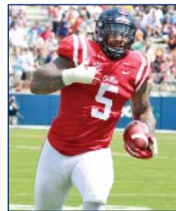
◀ RED TOP/ WHITE PANTS