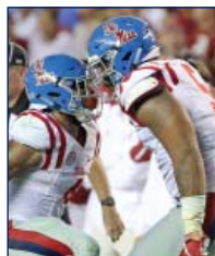
◀ POWDER BLUE HELMETS