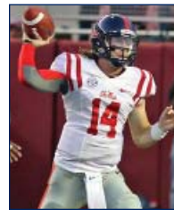
◀ WHITE TOP/ RED TRIM/ GRAY PANTS