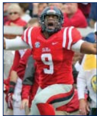
◀ RED TOP/ GRAY PANTS