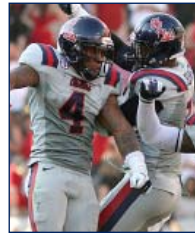
◀ GRAY TOP/ GRAY PANTS