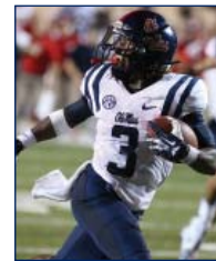
◀ WHITE TOP/ NAVY TRIM/ NAVY PANTS