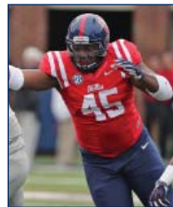
◀ RED TOP/ NAVY PANTS