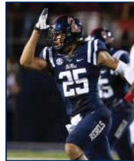
◀ NAVY TOP/ NAVY PANTS