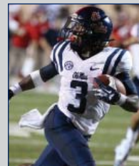
◀ WHITE TOP/ NAVY TRIM/ NAVY PANTS