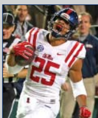
◀ WHITE TOP/ RED TRIM/ WHITE PANTS