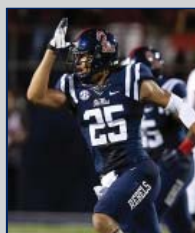
◀ NAVY TOP/ NAVY PANTS