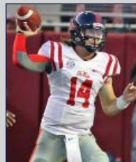
◀ WHITE TOP/ RED TRIM/ GRAY PANTS