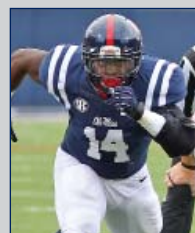
◀ NAVY TOP/ WHITE PANTS