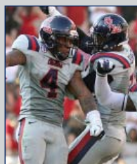
◀ GRAY TOP/ GRAY PANTS