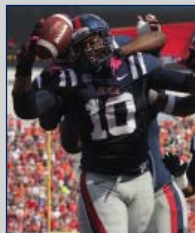
◀ NAVY TOP/ GRAY PANTS