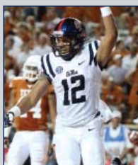
◀ WHITE TOP/ NAVY TRIM/ WHITE PANTS