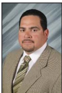
ETI ENA Defensive line Eastern Washington 2005