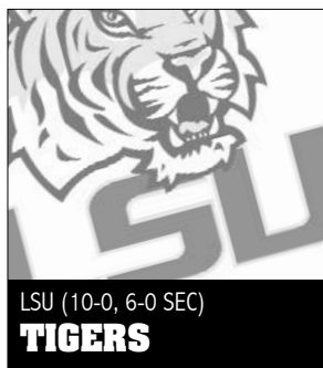
LSU (10-0, 6-0 SEC) TIGERS