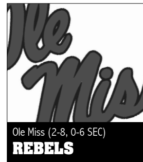
Ole Miss (2-8, 0-6 SEC) REBELS

Date . . . . .Nov. 19, 2011 Time . . . . .6:00 p.m. Series Record . . . . .LSU leads 56-39-4 Television . . . . .ESPN Site . . . . .Oxford, Miss. Venue . . . . .Vaught-Hemingway Stadium Capacity . . . . .60,580 Surface . . . . .FieldTurf Live Stats . . . . .OleMissSports.com