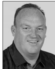
Keith Burns Secondary