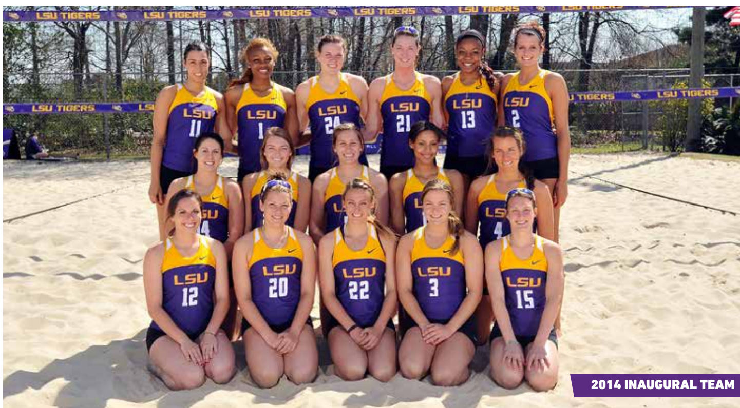
2014 INAUGURAL TEAM