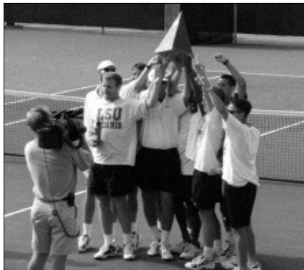
The 1998 & 1999 men's tennis teams won back-to-back SEC championships

Note: Before 1990, the SEC champion was the winner of the flighted tournament held at the end of the season.