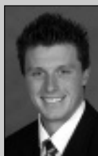
Ken Skupski Doubles - 2005