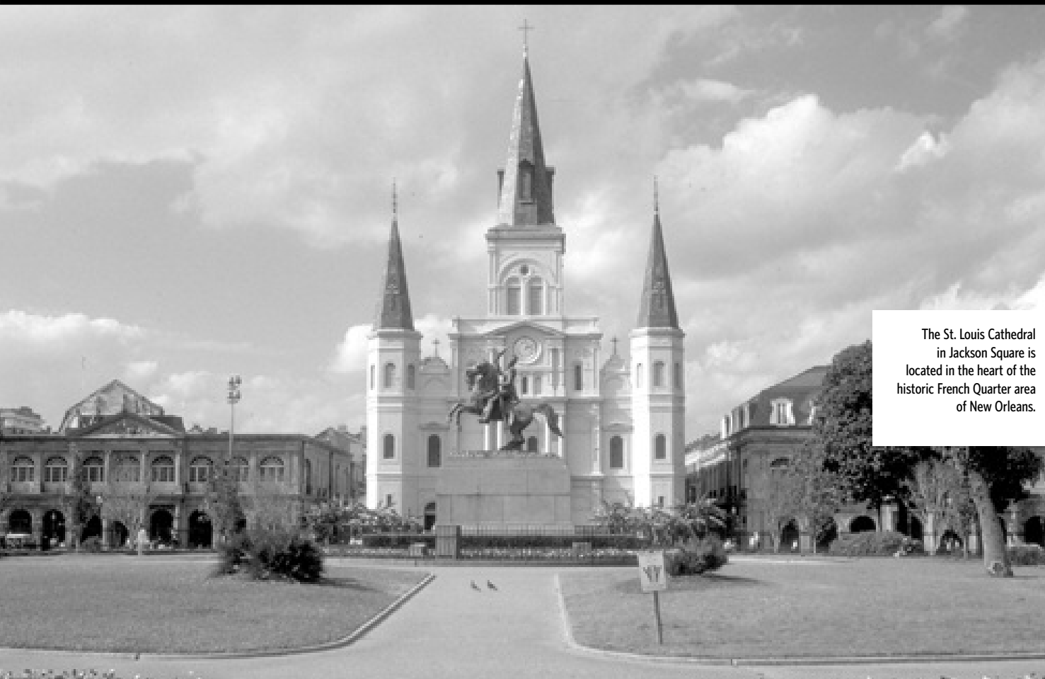
The St. Louis Cathedral in Jackson Square is located in the heart of the historic French Quarter area of New Orleans.