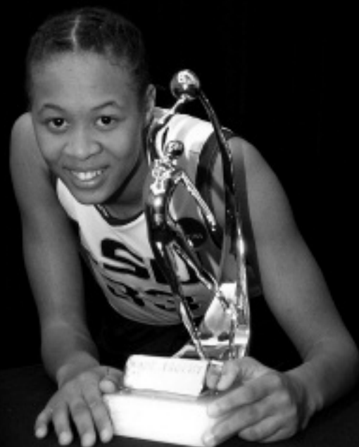
WADE, NAISMITH, AND WOODEN TROPHY WINNER FOR NATIONAL PLAYER OF THE YEAR - SEIMONE AUGUSTUS