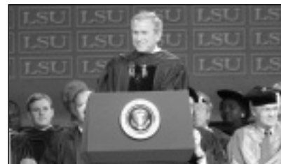
President George W. Bush 2004 LSU SPRING COMMENCEMENT

Strong supporters of education throughout the state have provided resources for a variety of innovative projects that are attracting world-class researchers and their expertise to LSU. The National Flagship Agenda is working to improve the standing of the University, as well as strengthen its position as an economic engine for the state of Louisiana. As a result, the University community is even more determined to achieve excellence at every level.