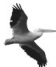
The East Brown Pelican is Louisiana's State Bird.

Foods like boiled crawfish, jambalaya, shrimp etouffee, and gumbo make the cajun and creole cuisine of Louisiana the envy of the nation.