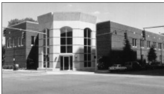
The SEC office located in Birmingham, Alabama.

The SEC currently regulates nine men's sports and 11 women's sports: Men—baseball, basketball, football, golf, swimming, tennis and track (cross country, indoor and outdoor). Women—basketball, golf, gymnastics, soccer, softball, swimming, tennis, track (cross country, indoor and outdoor) and volleyball.