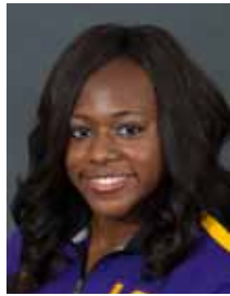
LLOIMINCIA HALL AA • 4-11 • So. • 1L Dallas, Texas